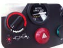
Heater System Webasto