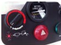
Heater System Webasto