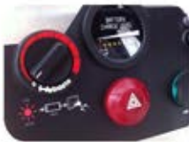
Heater System Webasto