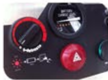
Heater System Webasto