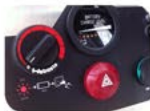
Heater System Webasto