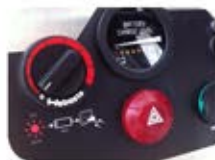
Heater System Webasto