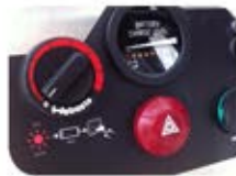
Heater System Webasto